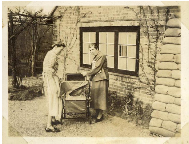
The house was 'sandbagged' in 1940