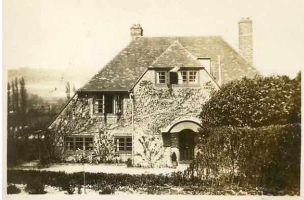
Churt House c1926