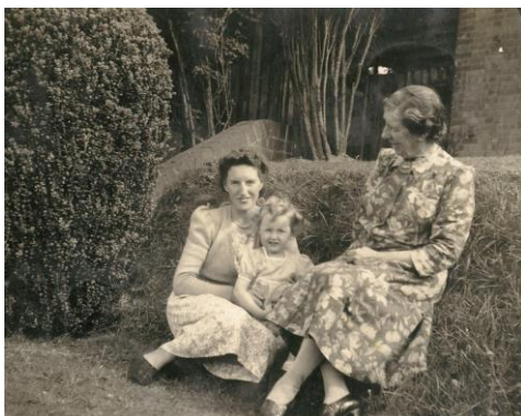
In the garden