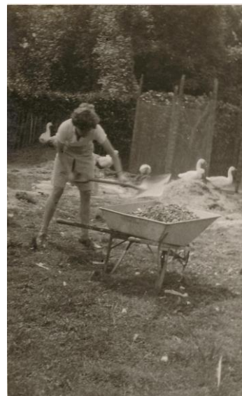
and carrying out landscaping work.