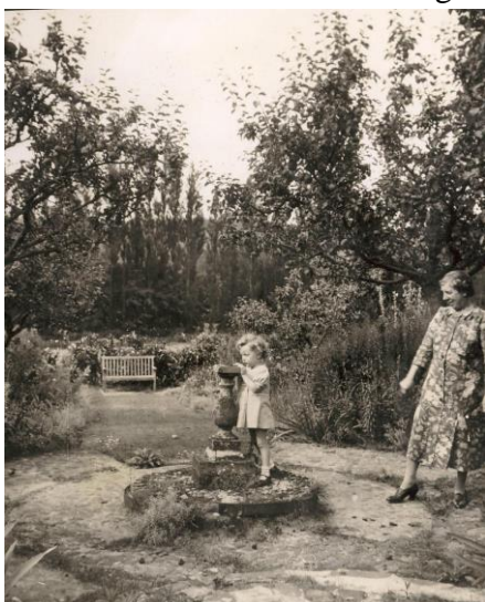
In the garden