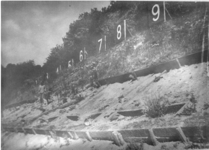
The 'new' Westcott Rifle Range

In 1909 the agreement was amended to apply to the new Surrey Territorial Force Association but a few years later, following increased use before and during the Great War and the introduction of more powerful weaponry, the Landbarn range was abandoned. It was replaced, in 1916, by a much larger 'War Office' range occupying almost 50 acres. This was constructed a few hundred yards to the west, much closer to the new Rifle Range Halt. The butts were built against the scarp slope of the North Downs and supported at least nine targets, as illustrated below: